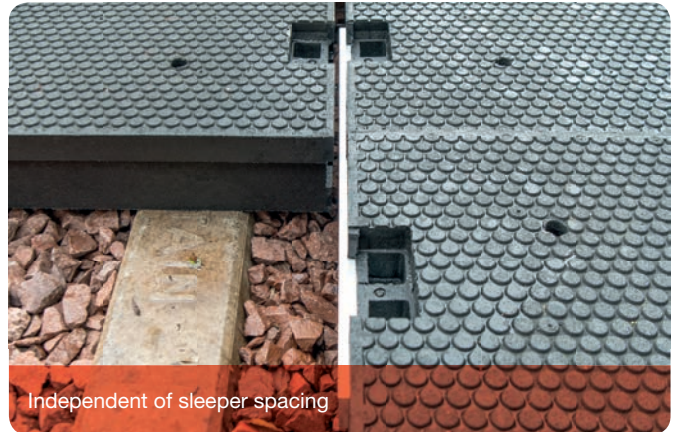
Independent of sleeper spacing