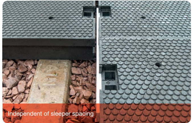
Independent of sleeper spacing