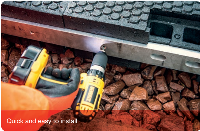
Quick and easy to install